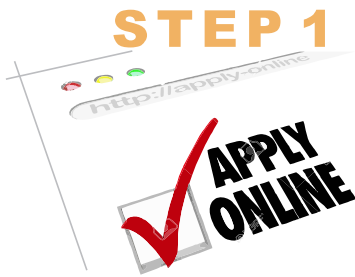
STEP 1 Your Successful Online application.

The application process for the Dip Interior Design consists of three steps.