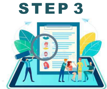
STEP 3 Online Follow up