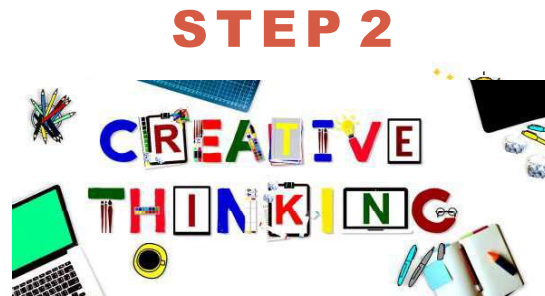
STEP 2 Submit a Digital Portfolio